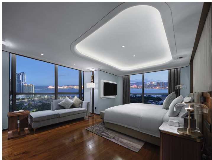
Sea View Big Room