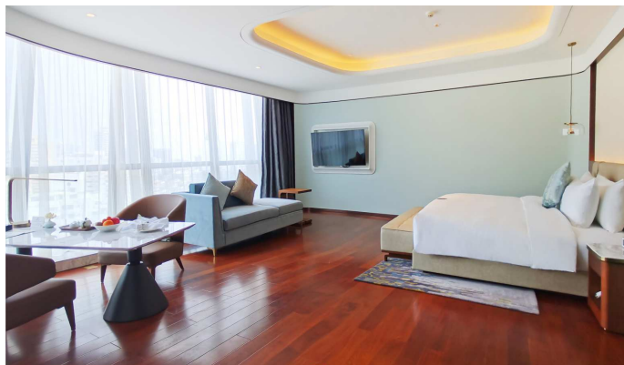
Lake View Big Room