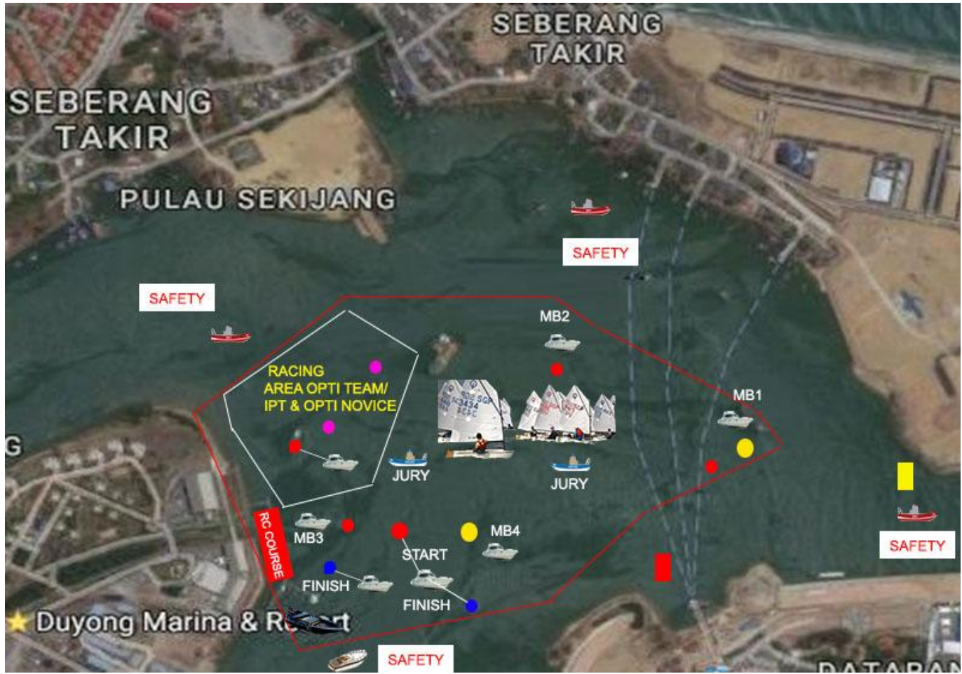
📍 Duyong Marina & Resort