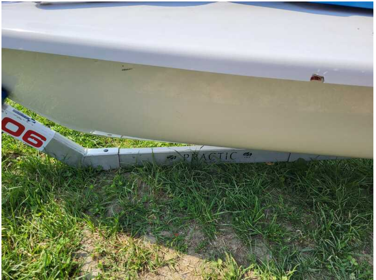
C807EBDF-3B52-41D5-844C-70B6782F5AC0.jpeg 459 KB