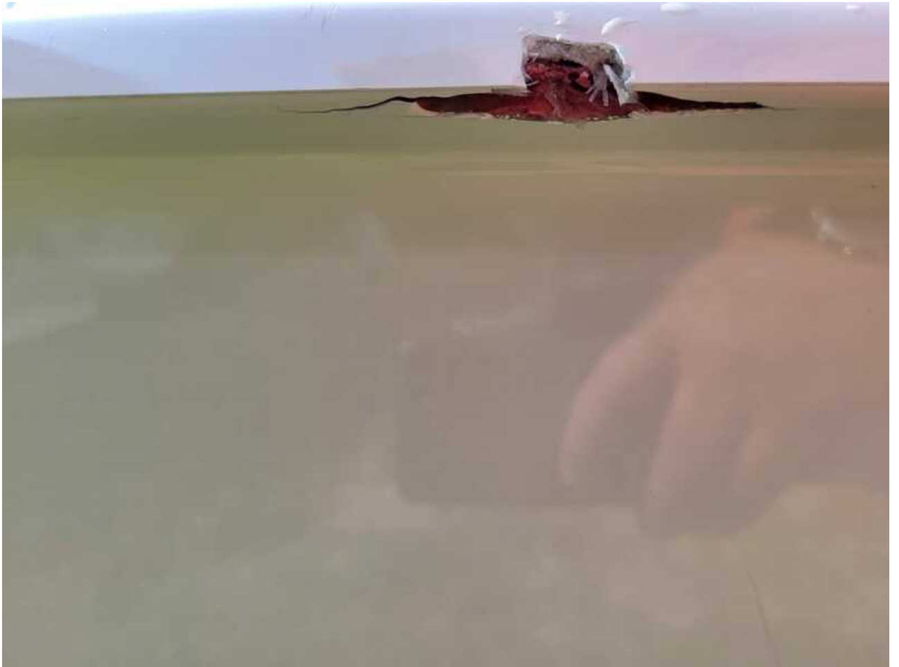
DDA30C09-2925-428F-A063-7D2E4448B1F2.jpeg 66.7 KB