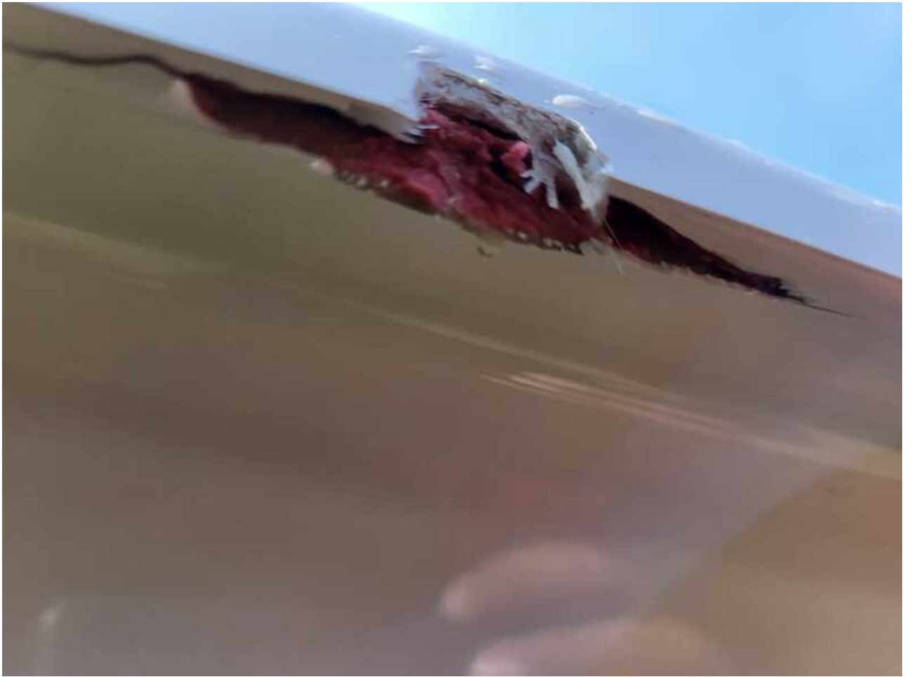
8BAE23D7-BF66-4220-A0F5-46816F0E8FCB.jpeg 74.1 KB