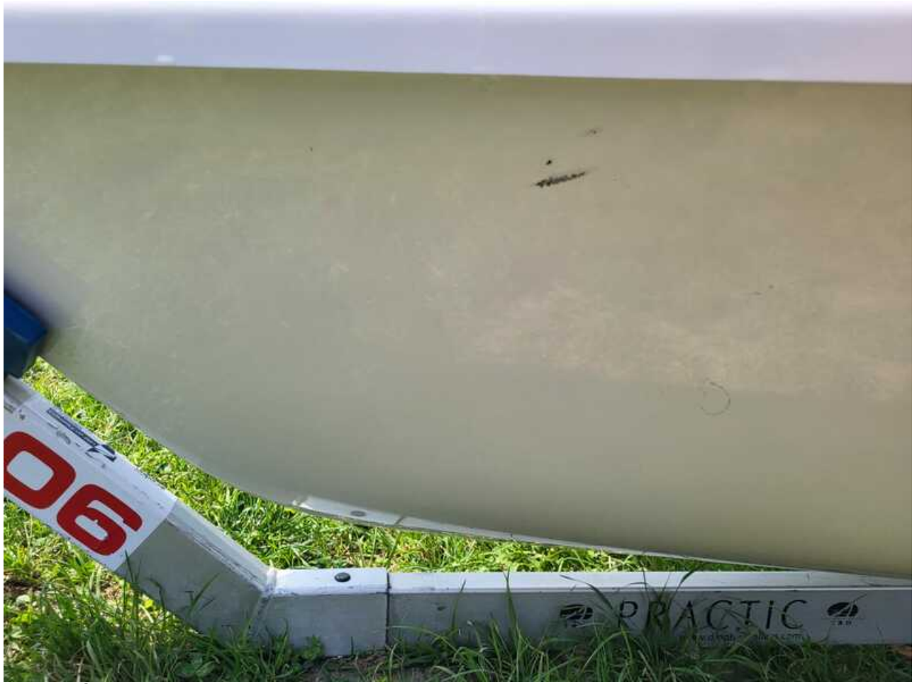
E4E5A9C6-B97E-410B-BFD0-2968E5155408.jpeg 206 KB