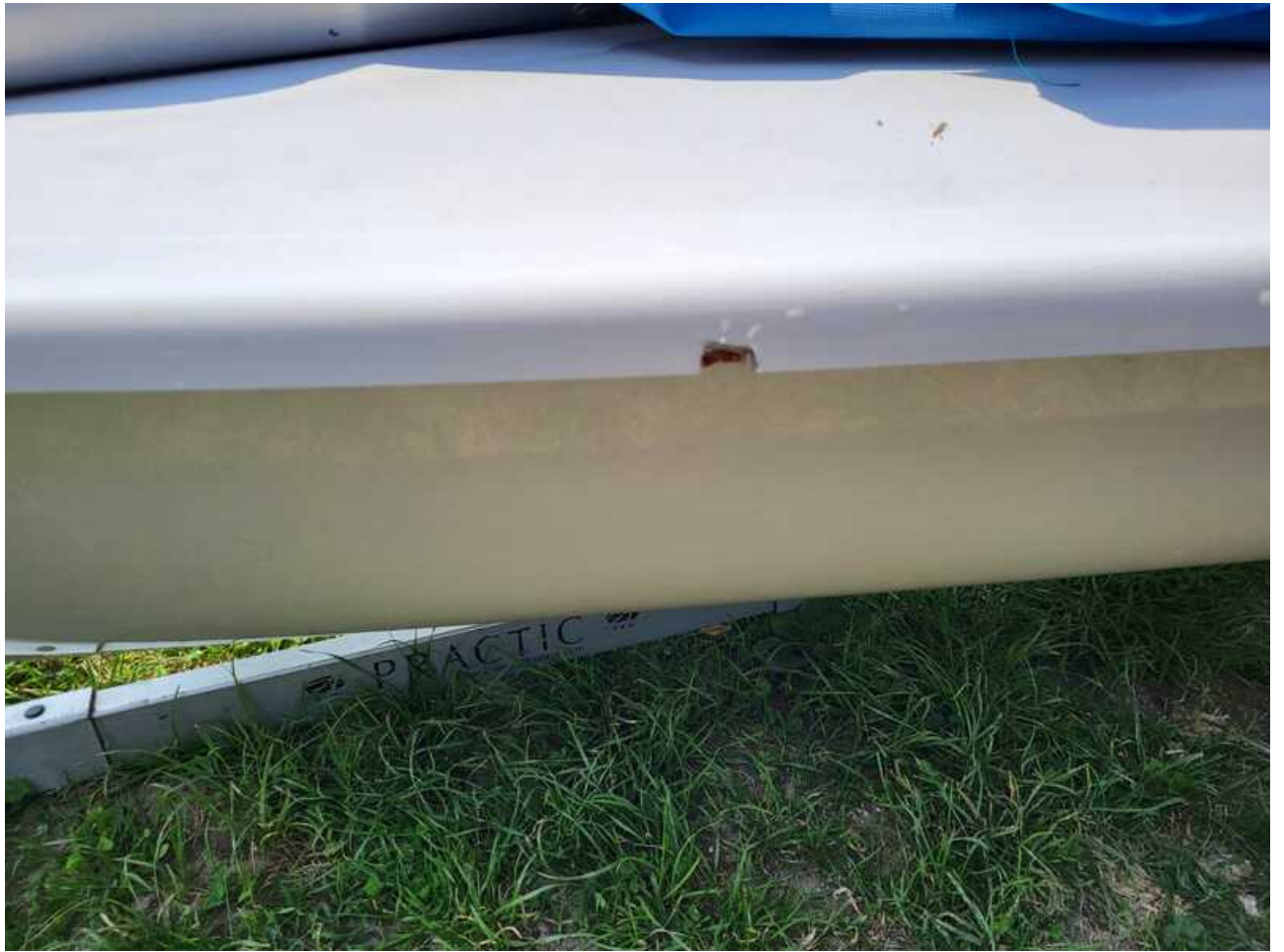
0C09BC0B-3D03-4CBF-8514-E4E8A4861C97.jpeg 296 KB