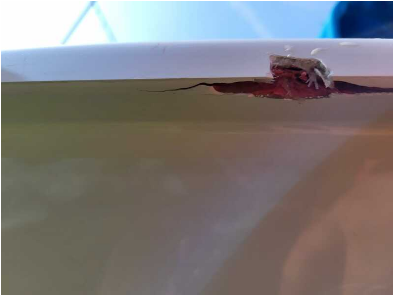
97D55095-DA9B-42EB-9C29-3ACD4EED2FCD.jpeg 48.2 KB