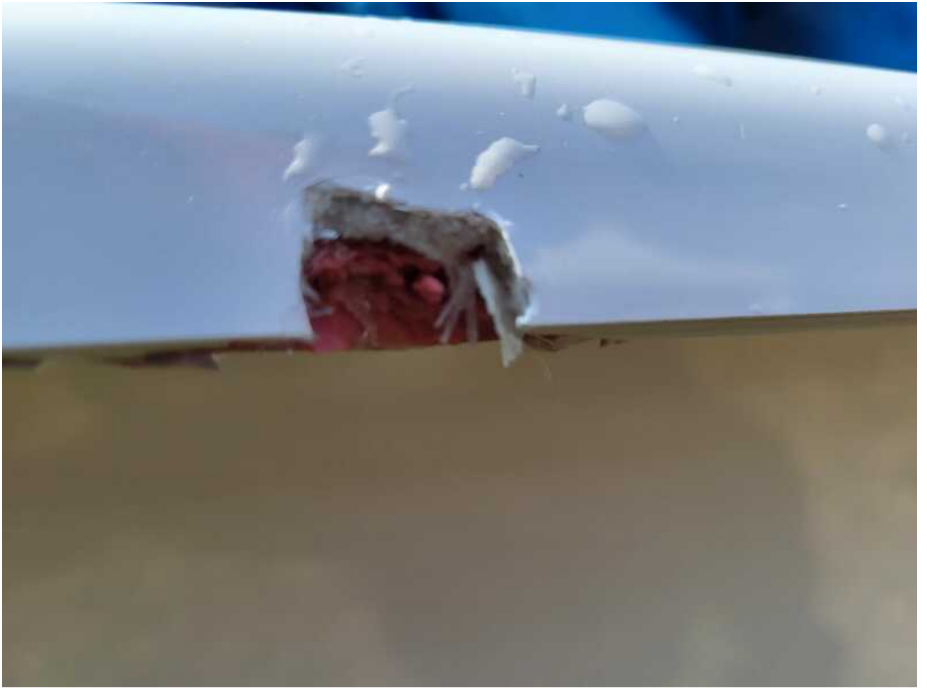
5E7E97C7-61B7-489F-89D8-3AAA5B6C333.jpeg 68.9 KB