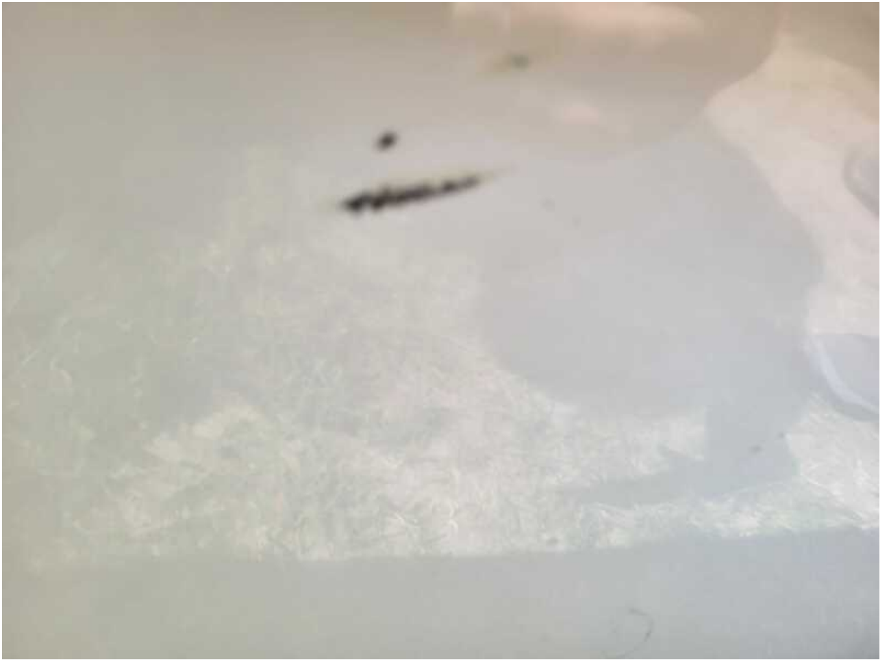
46A26183-B002-4FD2-8E44-4D7F284DFC6B.jpeg 62.5 KB