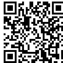
Submit Scoring Inquiry

NOTICE: When submitting a protest, request or report, the procedure (as set forth in the Racing Rules of Sailing and the Sailing Instructions) remains unchanged.