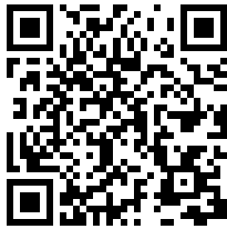
Submit Request for Hearing

Notice: This electronic notice board is the Official Notice Board (ONB) for this regatta.