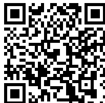
Submit Request for Hearing

Notice: This electronic notice board is the Official Notice Board (ONB) for this regatta.