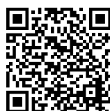
Official Notice Board