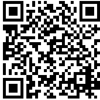
Submit Request for Hearing

Notice: This electronic notice board is the Official Notice Board (ONB) for this regatta.