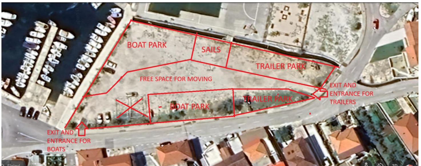
Insert B: detailed map