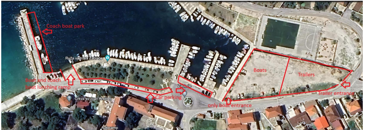
Dodatak B: detaljna mapa