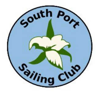
Notice of Race (NoR)

This Counter Regatta is sanctioned by the Canadian Shark Class Association