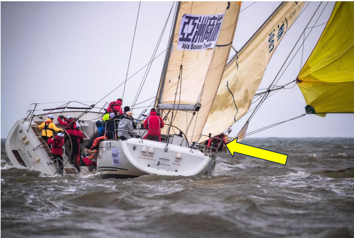
Figure 1 If a small red flag is flown on the stanchion or lifeline especially when crew members are wearing red, it does not satisfy the requirements of a protest flag that it is conspicuously displayed.