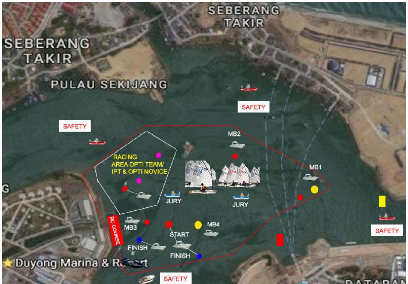
📍 Duyong Marina & Resort