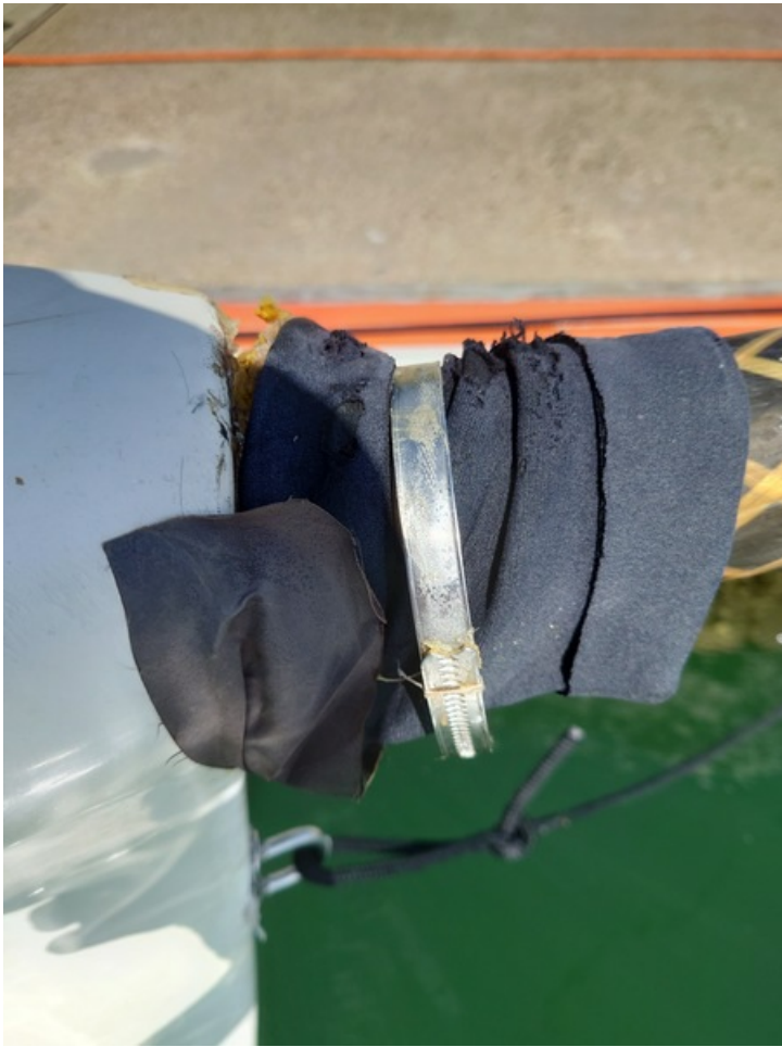
20230806_152443.JPG 2.21 MB