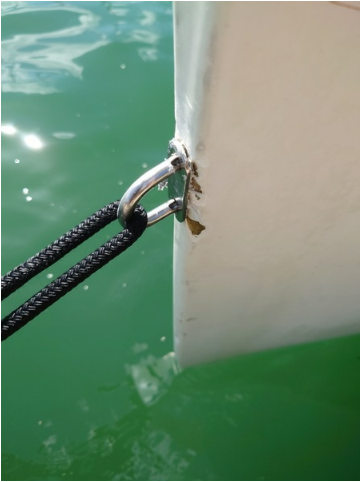
20230806_152434.JPG 1.51 MB