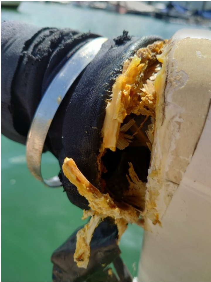
20230806_152502.JPG 2.01 MB