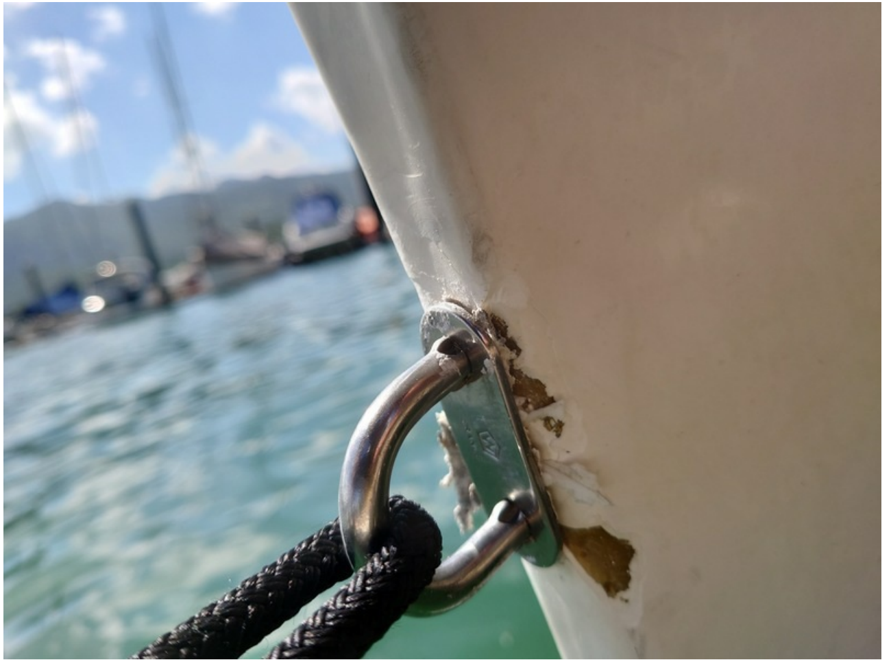
20230806_152457.JPG 1.56 MB