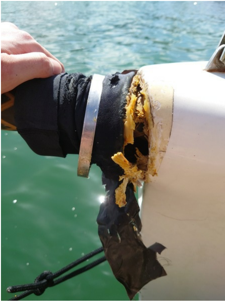
20230806_152430.JPG 1.98 MB