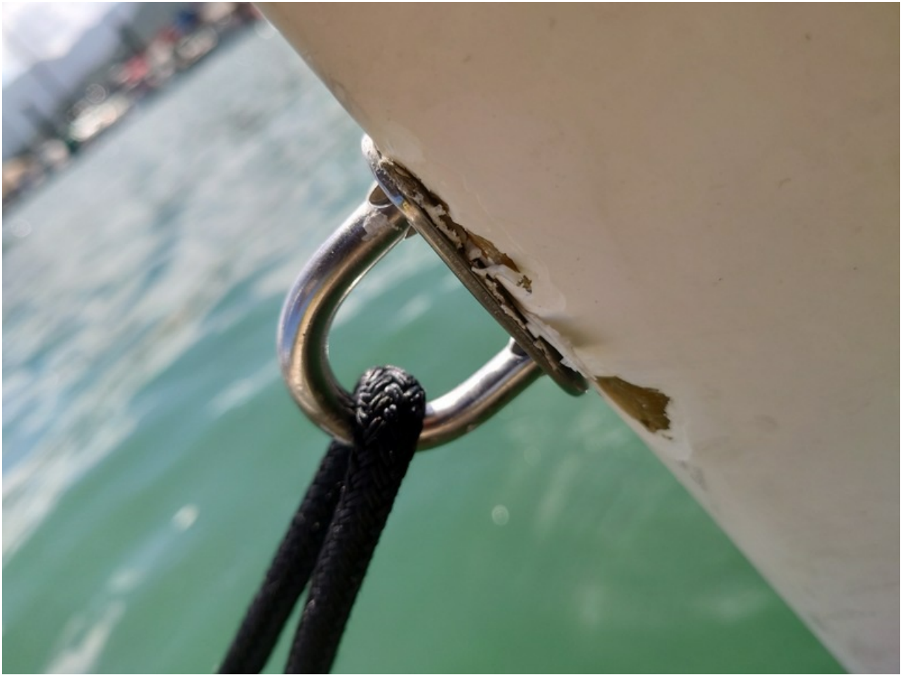
20230806_152454.JPG 1.42 MB