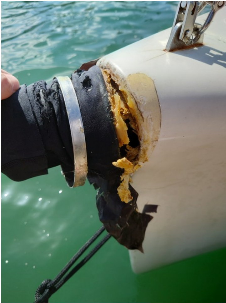
20230806_152427.JPG 2.02 MB