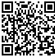
Submit Request for Hearing

Notice: This electronic notice board is the Official Notice Board (ONB) for this regatta.