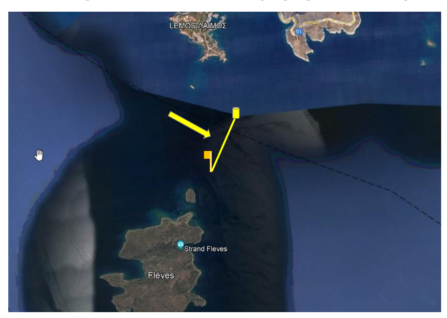
Finish Line on Paros, For displaying reasons only.