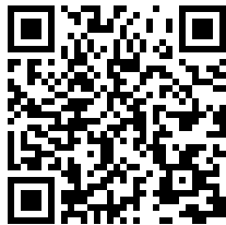
Submit Request for Hearing

Notice: The Official Notice Board (ONB) is still the only official source of information for this regatta.