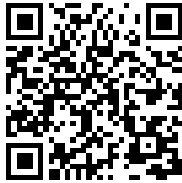
Submit Request for Hearing

Notice: This electronic notice board is the Official Notice Board (ONB) for this regatta.