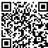
Submit Request for Hearing

Notice: This electronic notice board is the Official Notice Board (ONB) for this regatta.