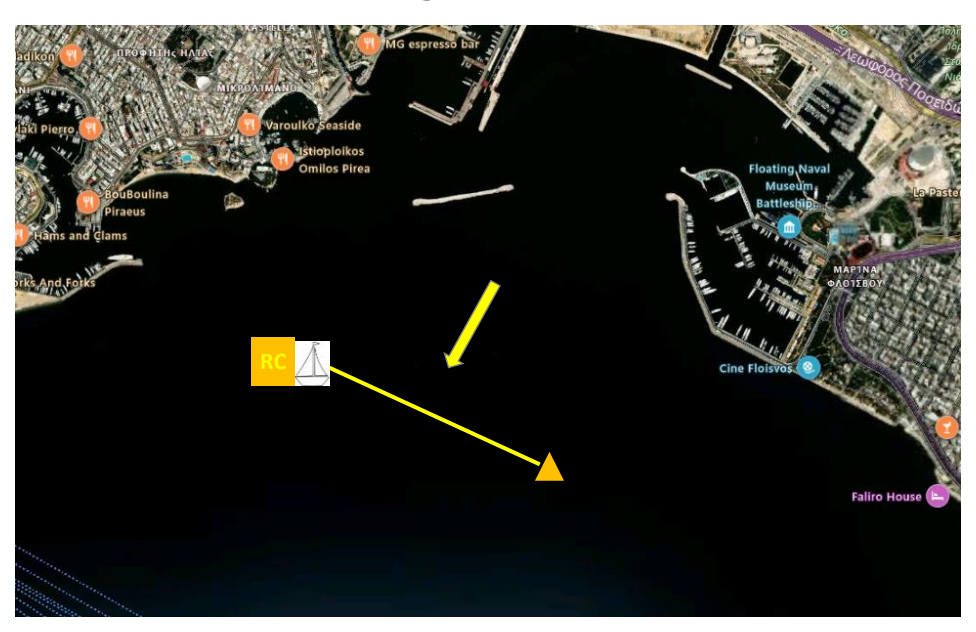
Finish Line on Faliro.