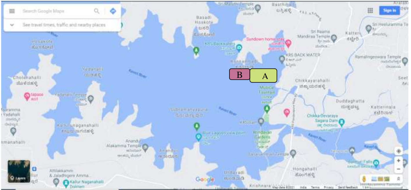
Venue : KRS Dam, Mysore