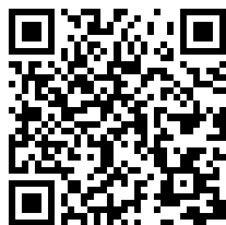
Submit Request for Hearing

Notice: This electronic notice board is the Official Notice Board (ONB) for this regatta.