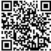
Submit Request for Hearing

Notice: This electronic notice board is the Official Notice Board (ONB) for this regatta.