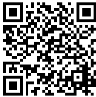
Submit Request for Hearing

Notice: This electronic notice board is the Official Notice Board (ONB) for this regatta.