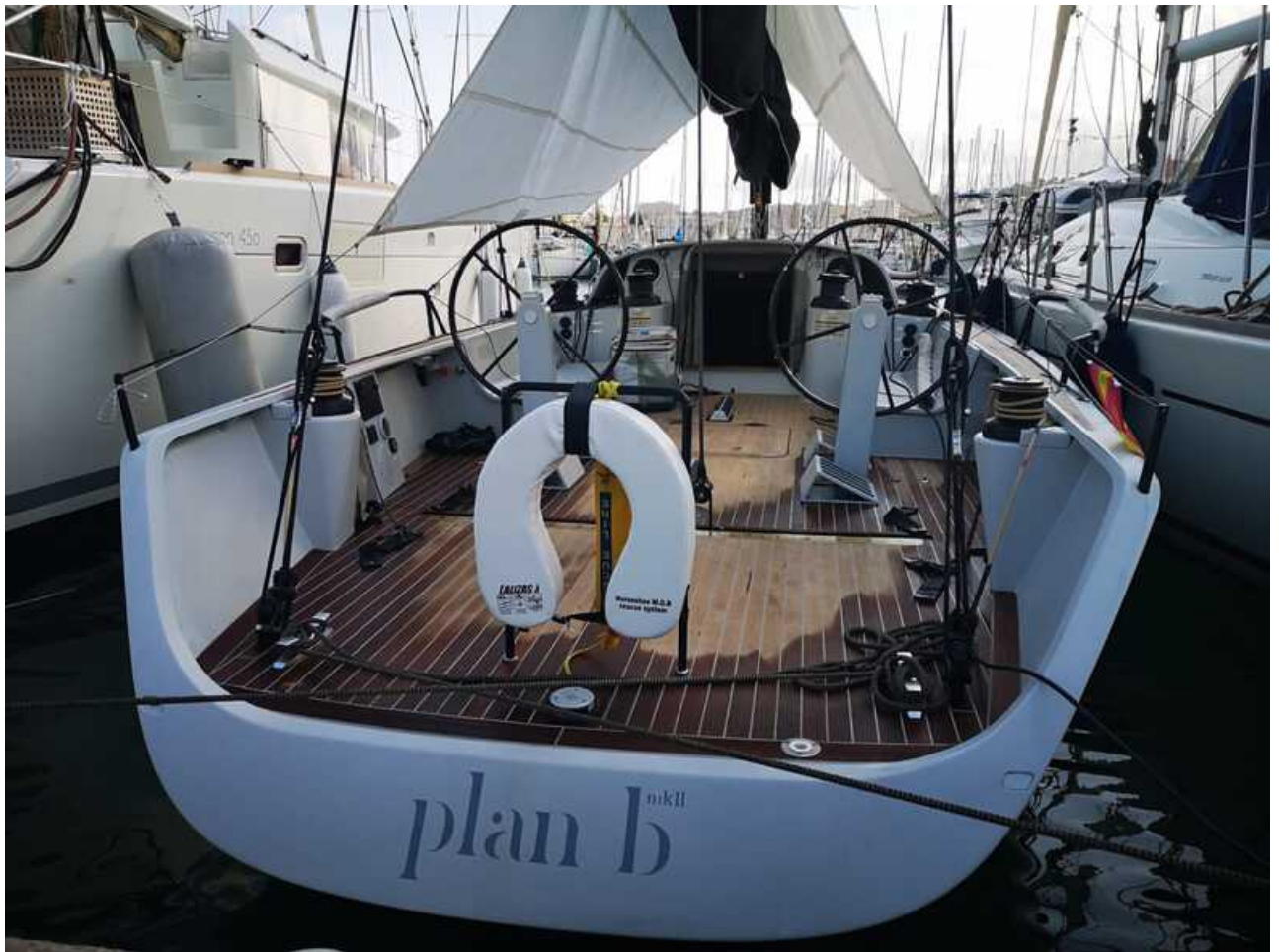
4.jpg 226 KB