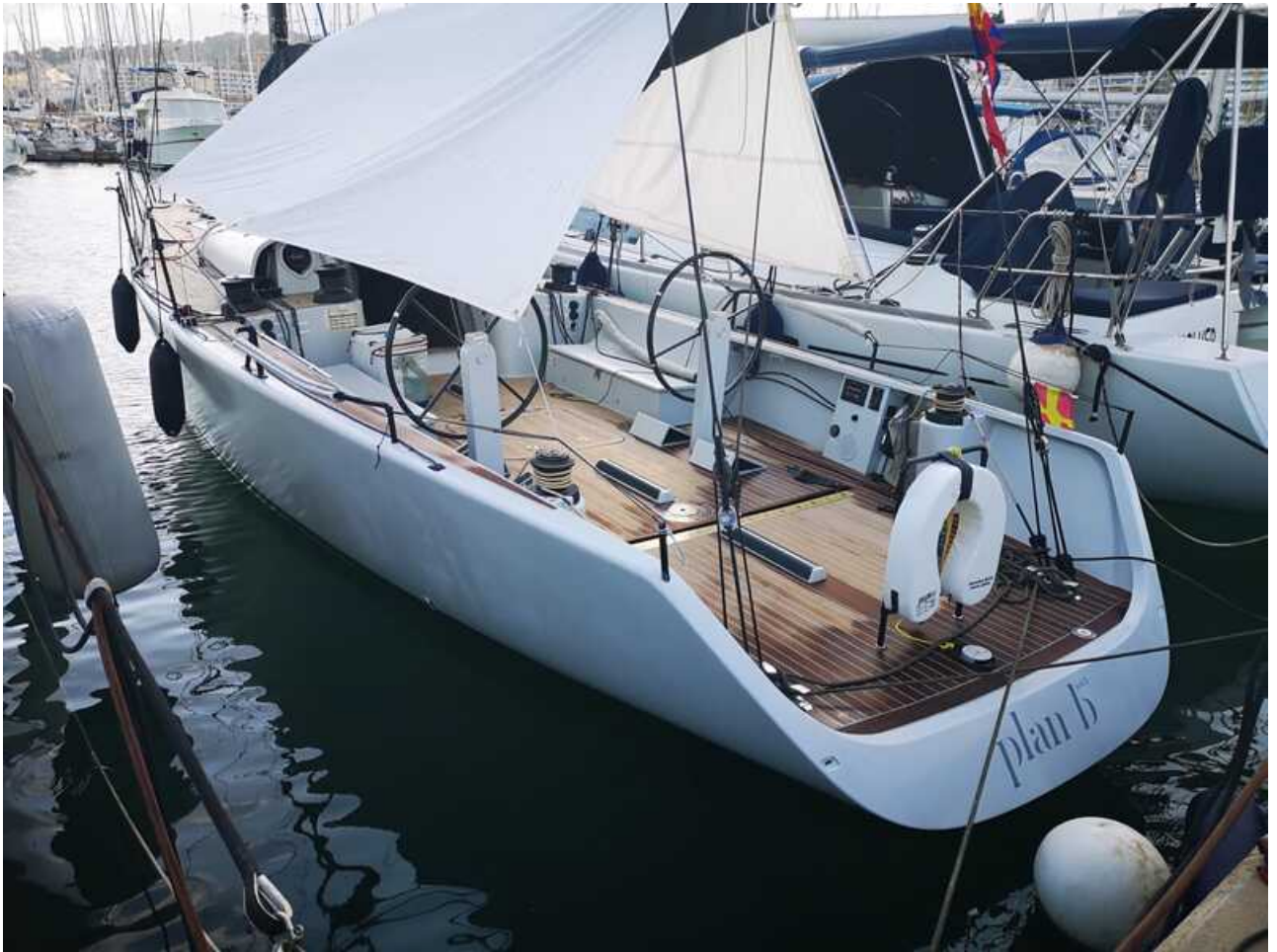
2.jpg 241 KB