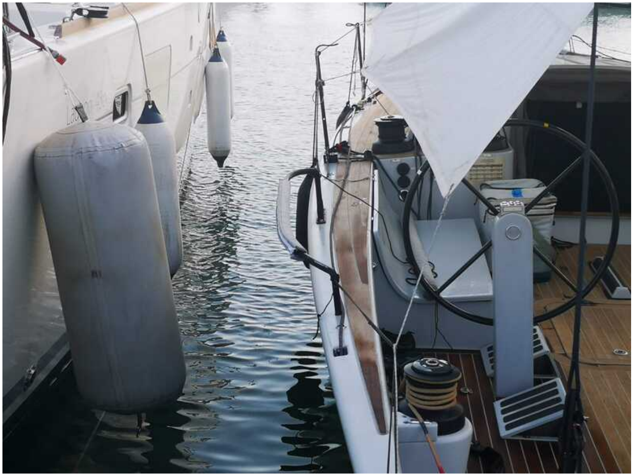
3.jpg 201 KB