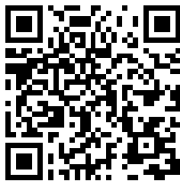
Submit Request for Hearing

Notice: This electronic notice board is the Official Notice Board (ONB) for this regatta.