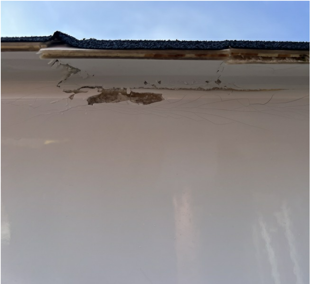
IMG_2371.jpeg 1.63 MB