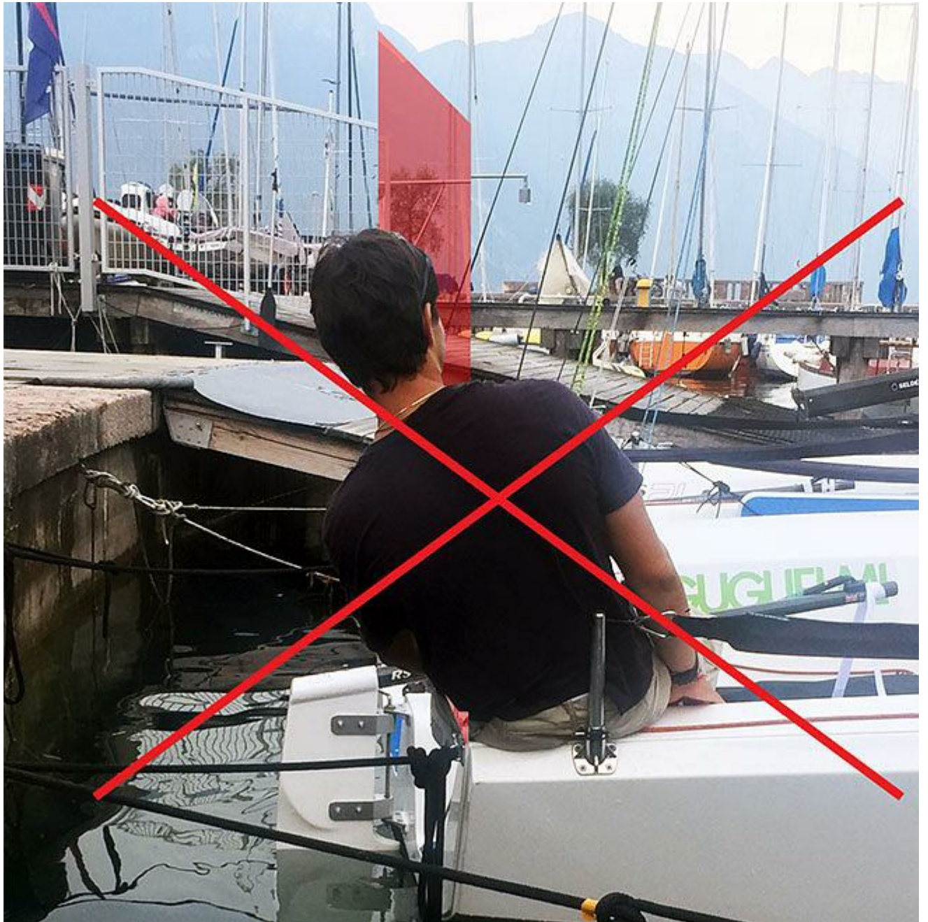
c3.3 interpretation 02.jpg 165 KB