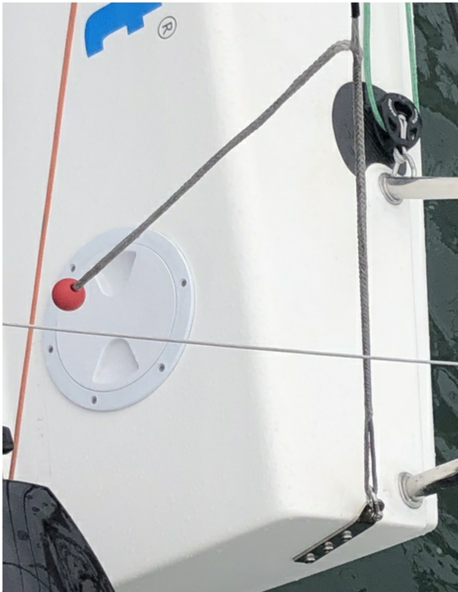
IMG_9046.jpg 636 KB