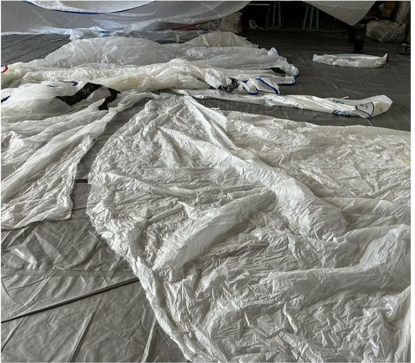
IMG-20260604-WA0000.jpg 374 KB