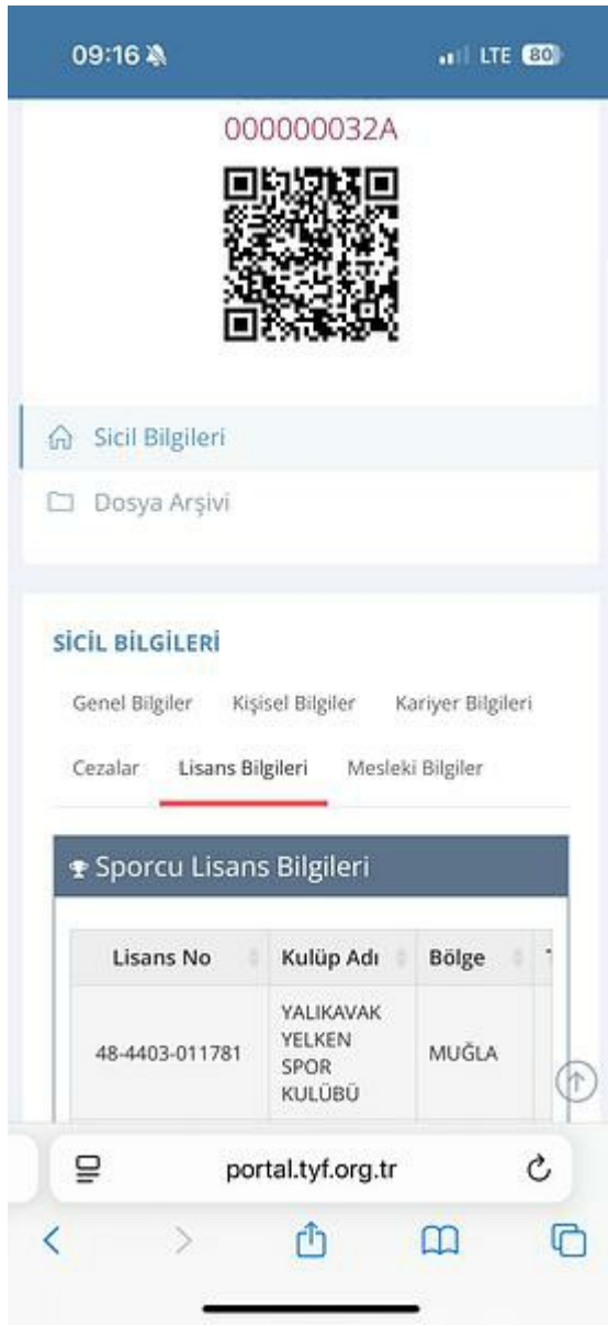
WhatsApp Image 2025-08-10 at 09.16.08.jpeg 114 KB