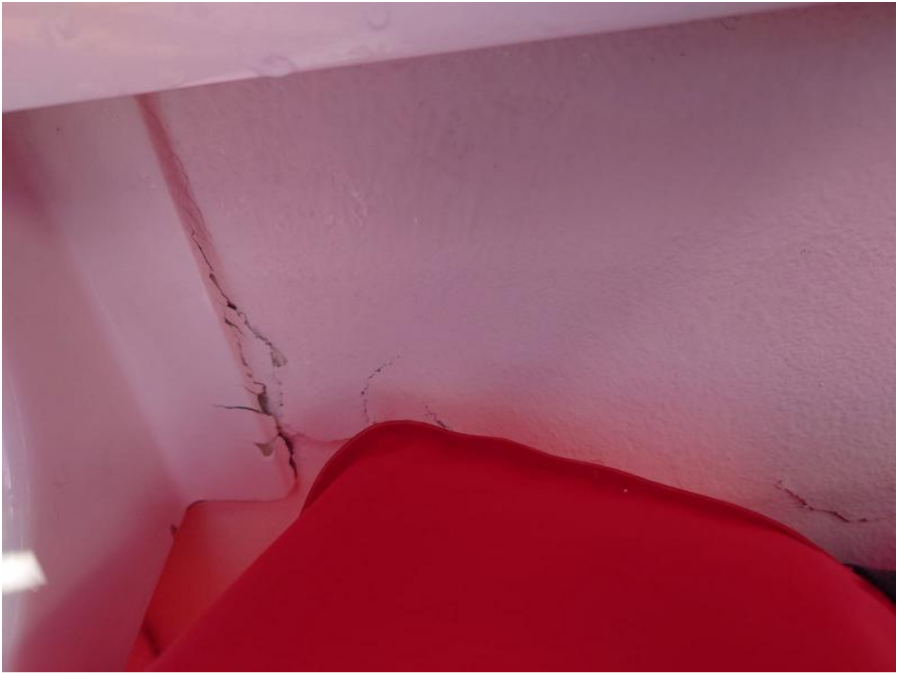
centre_bar_delamination.jpg 20.3 KB