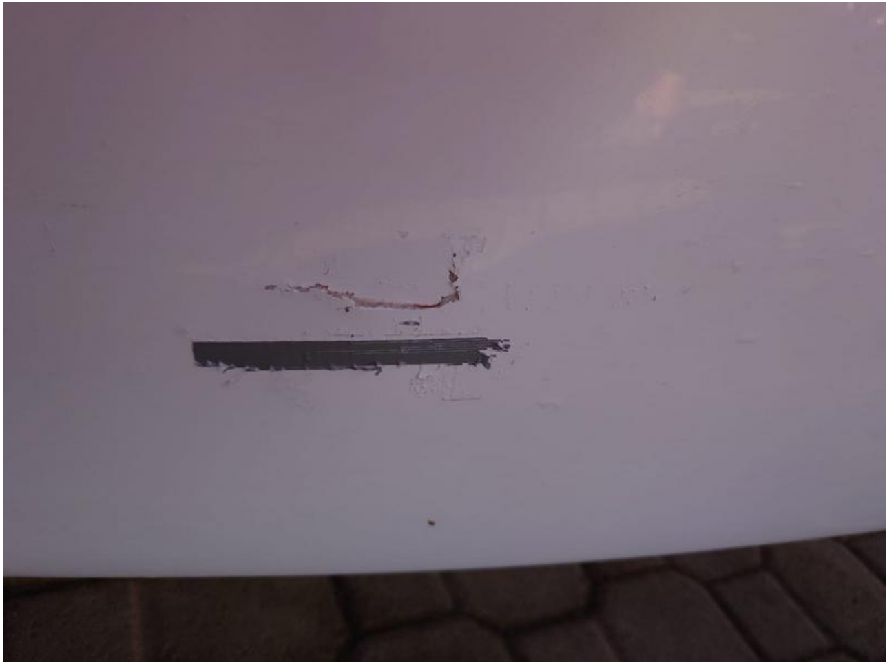
rear_crack.jpg 13.2 KB