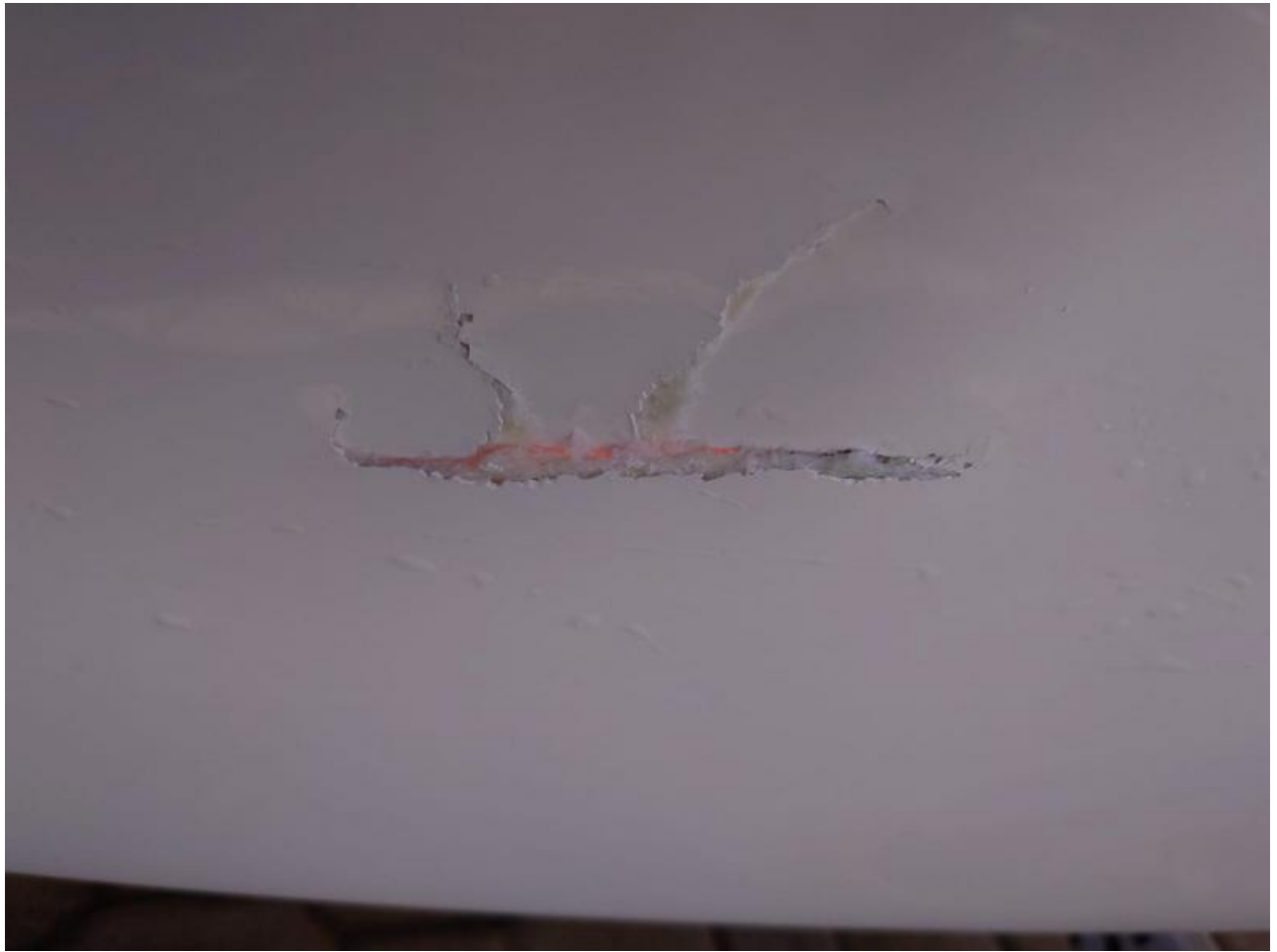
front_crack_from_outside.jpg 11.3 KB