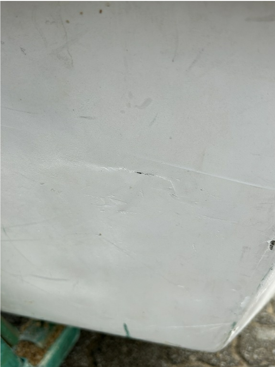
IMG_9529.jpeg 1.78 MB