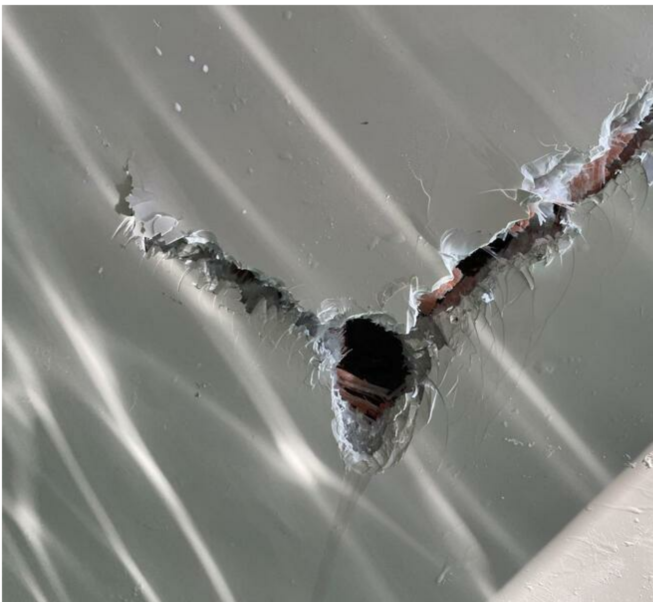
IMG_9827.jpeg 151 KB